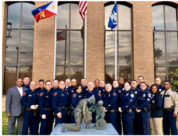
Class photo of participants in the Louisiana Sergeant Academy hosted by the Lafayette Police Department. This class was held Jan 13-17, 2020.

Police officers are allowed to use force within the confines of state and federal law, and United States Supreme Court decisions. Put concisely, officers may use physical force (anything greater than a firm grip) only for the protection of human life, to prevent bodily harm, or to affect an arrest that is actively being defeated. The force that an officer employs must meet the standard of a two-part test. First, the force must be necessary to protect human life, pre-