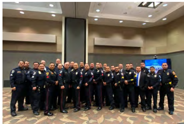
Graduates of the Texas Sergeant Academy hosted by Harlingen Police Department Jan 20-31, 2020.