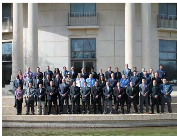
Class photo of participants in the 130th School of Police Supervision held Feb 3-28, 2020 and hosted by the Southlake Police Department.