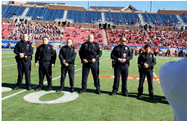
Six Texas law enforcement officials honored for their life saving efforts at the First Responder Bowl game on Dec 30, 2019.